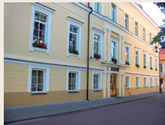
Ministry of Education and Science

Goals and objectives of the Ministry of Education and Science: to implement the national system of formal and non-formal education which secures social attitudes in favour of education and creates conditions for lifelong learning in a changing democratic society; to implement the state policy of science and studies in accordance with the Law on Science and Studies and other legal acts; to coordinate the activity of Lithuanian institutions of science and studies, etc. In order to implement the assigned tasks, the Ministry develops one-year and long-term educational investment programmes, approves requirements for the regulations of state-run and municipal schools; approves the general curriculum content of formal education, and achievement levels; organizes and coordinates the accreditation of the secondary education programme; approves the procedure of consecutive learning under general education programmes